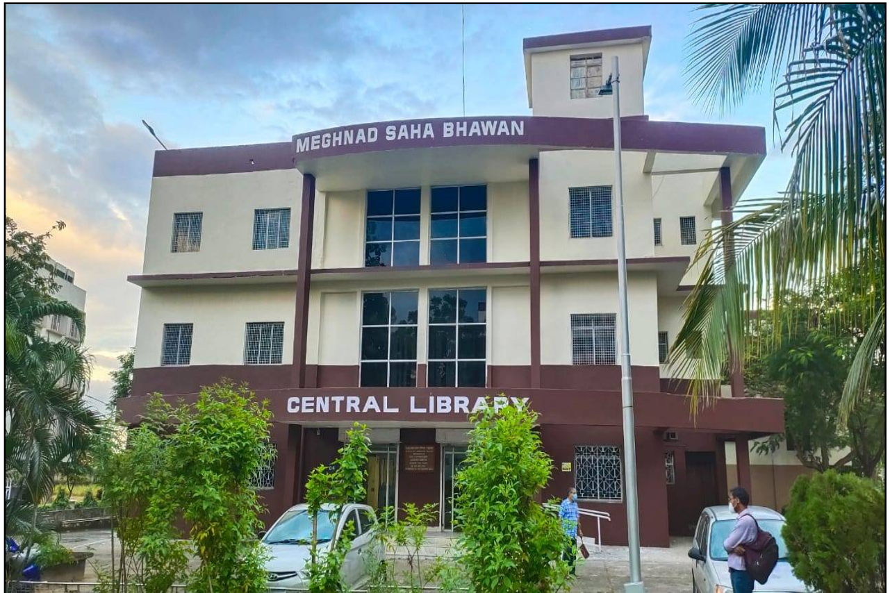
Dr Meghnad Saha Central Library Estd 2007

[Ref.: NAAC-AQAR Report, July 2023 – June 2024]