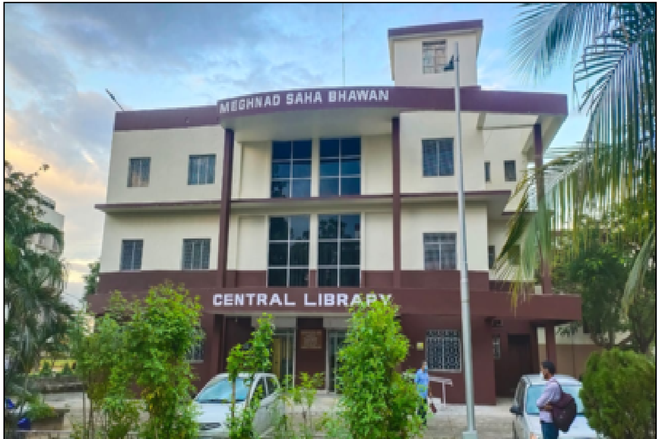
Dr Meghnad Saha Central Library Estd 2007

[Ref.: NAAC-AQAR Report, July 2023 – June 2024]