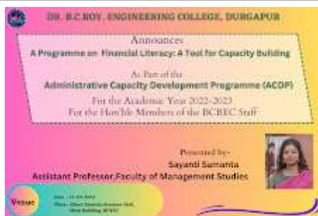
ACDP Staff.jpg 1398K